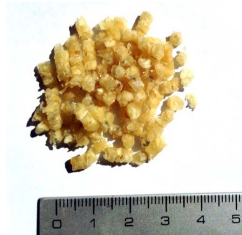
Fig. 3: Basic material: dried, pre-crushed mushrooms

An example from the industry of food and life science impressively shows the difference between established instruments to date (for example the PULVERISETTE 14 classic line ) and the PULVERISETTE 14 premium line . With the PULVERISETTE 14 premium line dry mushrooms were comminuted (fig. 2) double as fine as it was possible with to date available Centrifugal Mills (fig. 3). The cell walls of mushrooms contain among other things the so called \beta -1,3-glucan, which in vitro and in animals based on in-vivo examinations stimulates the immune system and supports et al. the healing of wounds [1], [2] . Due to a better fine grinding the active component can be extracted more effectively. The familiar cytotoxic effect of \beta -glucan in the course of cancer treatment is based rather on the impurities of the active component, because if instead of the concentrated, pure \beta -glucan was used, no cytotoxic effect was detected [3] .