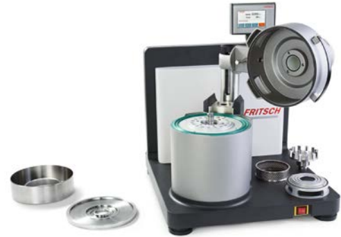
Fig.. 1: FRITSCH Variable Speed Rotor Mill PULVERISETTE 14 premium line

A never before achieved fineness with a centrifugal mill is attained in a short amount of time with the new FRITSCH PULVERISETTE 14 premium line (fig. 2). This became possible because the rotor peripheral speed was increased by more than 20% up to 110m/s, in comparison to instruments to date. A higher fineness is interesting in many aspects: Since many materials change their characteristics and their effects on the organism depending on the particle size, this is interesting for example in the area of exploration of new active components of pharmaceutical products.