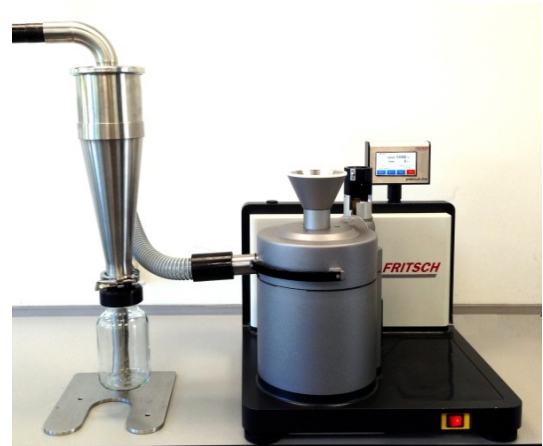
Fig. 5: PULVERISETTE 14 premium line with stainless steel Cyclone Separator converted for the comminution of larger amounts

Fig. 3 shows in comparison the particle size distribution after the comminution of the sample with the PULVERISETTE 14 classic line (20.000 rpm, 0.08 mm sieve ring with trapezoidal perforation, rotor with 24-ribs) and the PULVERISETTE 14 premium line (22.000 rpm, 0.08 mm sieve with ring trapezoidal perforation rotor with 24 ribs). In comparison, to the comminution with the PULVERISETTE 14 classic line the material is double as fine. The d50-value was halved from 26 µm down to 13 µm. The d90-value was also halved (63 µm to 33 µm).