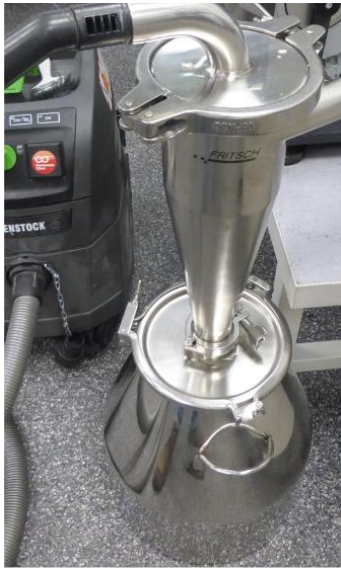
Fig. 3: Cyclone with vacuum and 20 litre sample collecting vessel