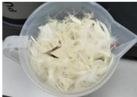
Fig. 1: Sample of down feathers

The sample was fed in quickly, a batch of 50 grams of feathers (3-4 cm length) was processed.