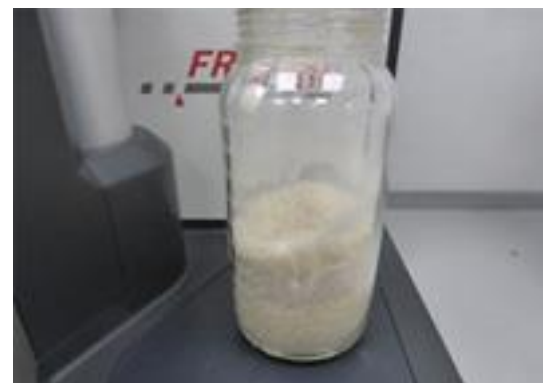
Fig. 2: Ground sample in 1 litre sample glass

Due to the large volume of the comminuted sample, the 1 litre jar was replaced by the 20 litre collection jar after a grinding time of 30 seconds.