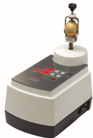
Fig. 1: Mini-Mill PULVERISETTE 23

Prior to the decision of utilizing a FRITSCH Mini-Mill PULVERISETTE 23 for this task, was the issue of the careful preparation of dried endospores of the bacillus atrophies. Decisive in this case was how the mechanical maceration influences the recovery rate, respectively the survival rate of this micro biological main bacteria. Here various test-runs with altered grinding parameters were performed.